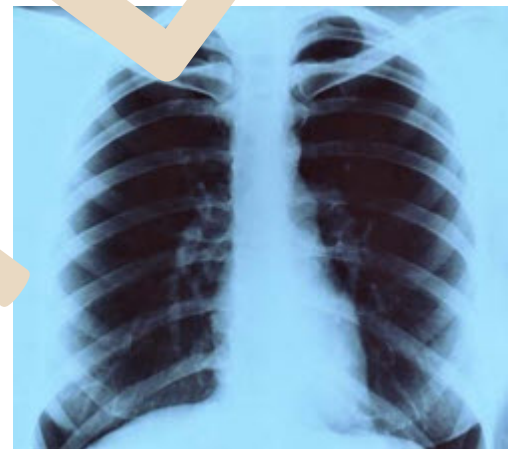
An X-ray showing evidence of pneumonia

To learn how you can prevent pneumonia among your clients, continue reading this inservice.